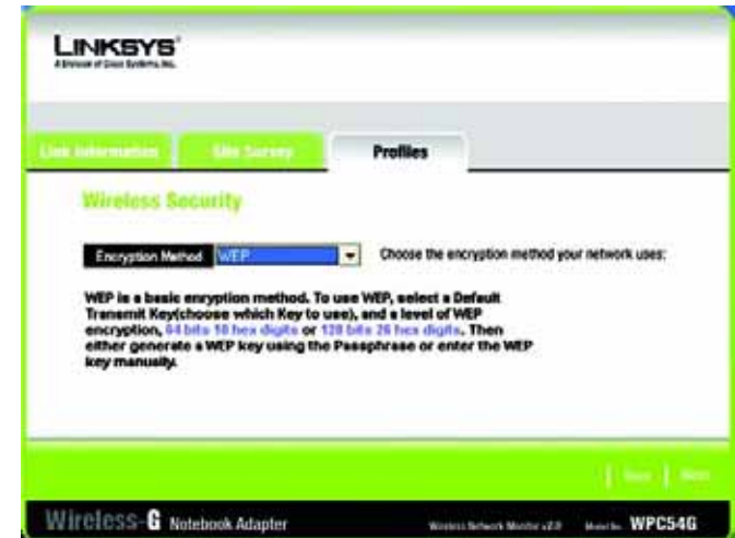
Figure 6-13: Wireless Security for New Profile

Click Help for more information about this screen and these settings. Click Next to continue, or Cancel to return to the Profiles screen.